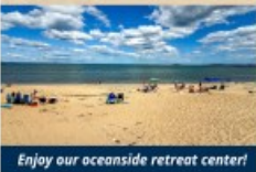
Enjoy our oceanside retreat center!