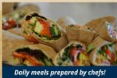
Daily meals prepared by chefs!