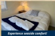
Experience seaside comfort!