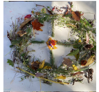
The mandalas we made on Sunday morning